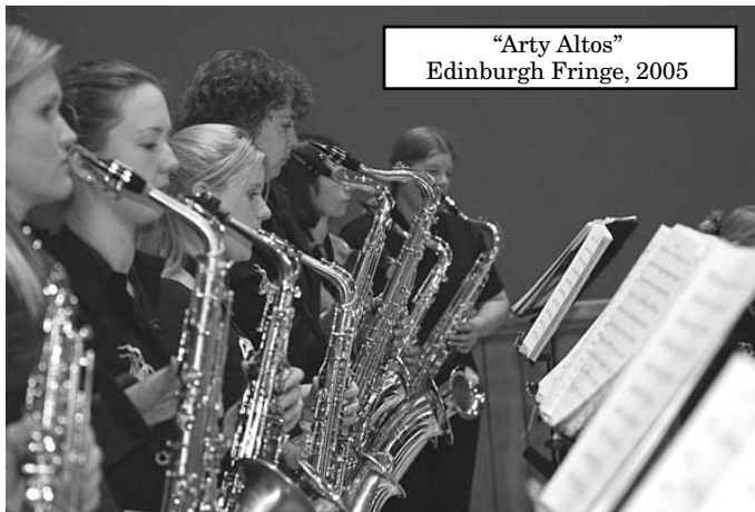
"Arty Altos" Edinburgh Fringe, 2005