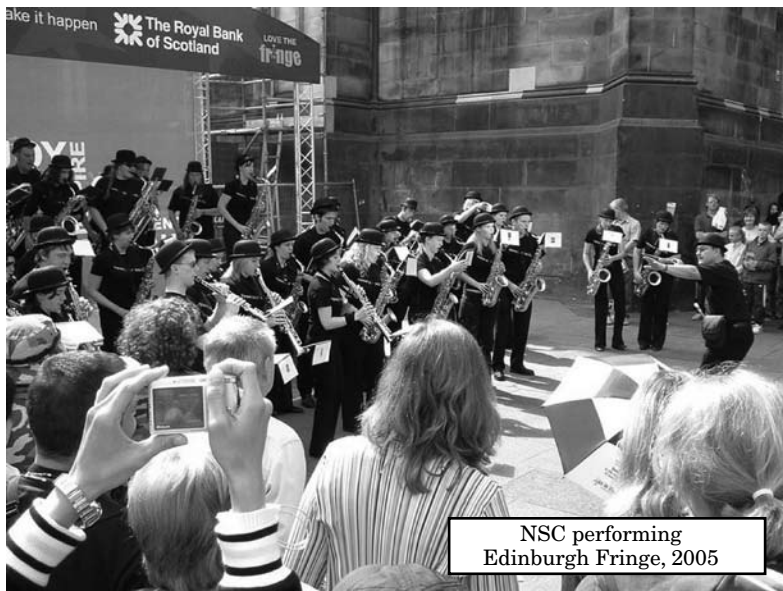
NSC performing Edinburgh Fringe, 2005

"I also got in touch with the German manufacturer, Benedikt Eppelsheim, and as soon as I heard that they also produced a piccolo sax, I immediately wanted one. Benedikt kindly lent me a soprillo which I later bought and I now assist him by providing player feedback. It really is an extraordinary little instrument, with its octave key in the mouthpiece, and so small that even half a millimetre can make a difference. But it's certainly